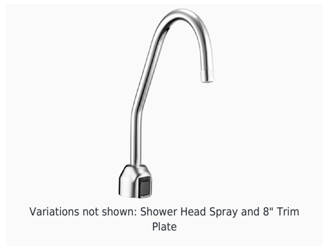
Variations not shown: Shower Head Spray and 8" Trim Plate